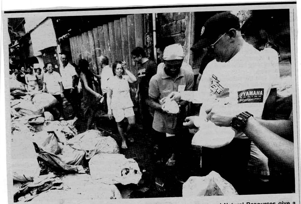
OFFICIALS of Barangay Daang Hari and Department of Environment and Natural Resources give a plastic bag of rice in exchange for a bag of garbage to residents during a clean-up operations in Navotas City. (Jansen Romero)