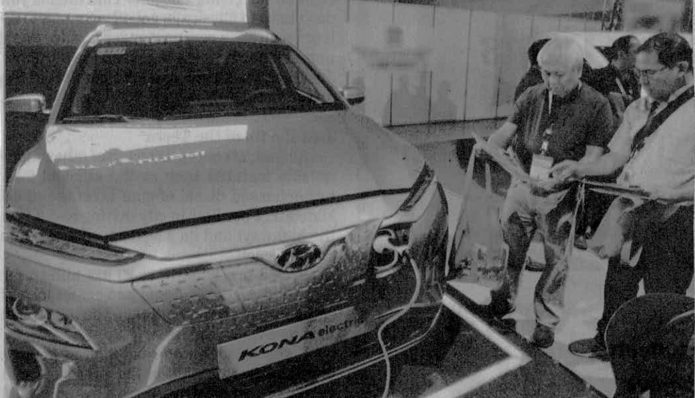
The Hyundai Kona Electric on display at the recent Philippine Electric Vehicle Summit.

She said "incentives are crucial to change the behavior of market players and promote demand for xEV and private investment across the value chain.'