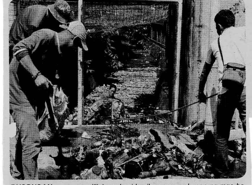
PUSPUSAN na ang paglilinis sa kani-kanilang nasasakupan ng mga barangay chairman at mayors gaya ng makikita sa larawan kung saan lumusong ang mga trabahador ng Makati City Environmental Department sa maruming tubig ng mga estero na punong-puno ng basura na itinatapon ng mga residente sa Brgy. San Isidro. Ayon sa mga naglilinis, ito na ang pangalawang hakot ng truck ng basura sa nasabing lugar.

Libreng makukuha ang kopya ng The RiverMan sa PRRC office samantalang ang electronic copies ay maaring hugutin sa Freedom of Information portal.